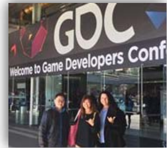
CLH Mobile Games App Immersive Fellows at the Game Developers Conference