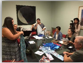
CLH Fashion Immersive Finalists kick off L.A. for business meetings