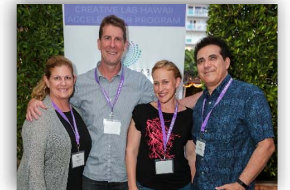
CLH Animation Immersive mentors – Kaaren Lee Brown, Cinco Paul, Pamela Ribon and CLH ED Michael Palmieri