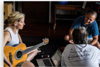
CLH Music Immersive Fellows co-writing songs for film/TV with mentors