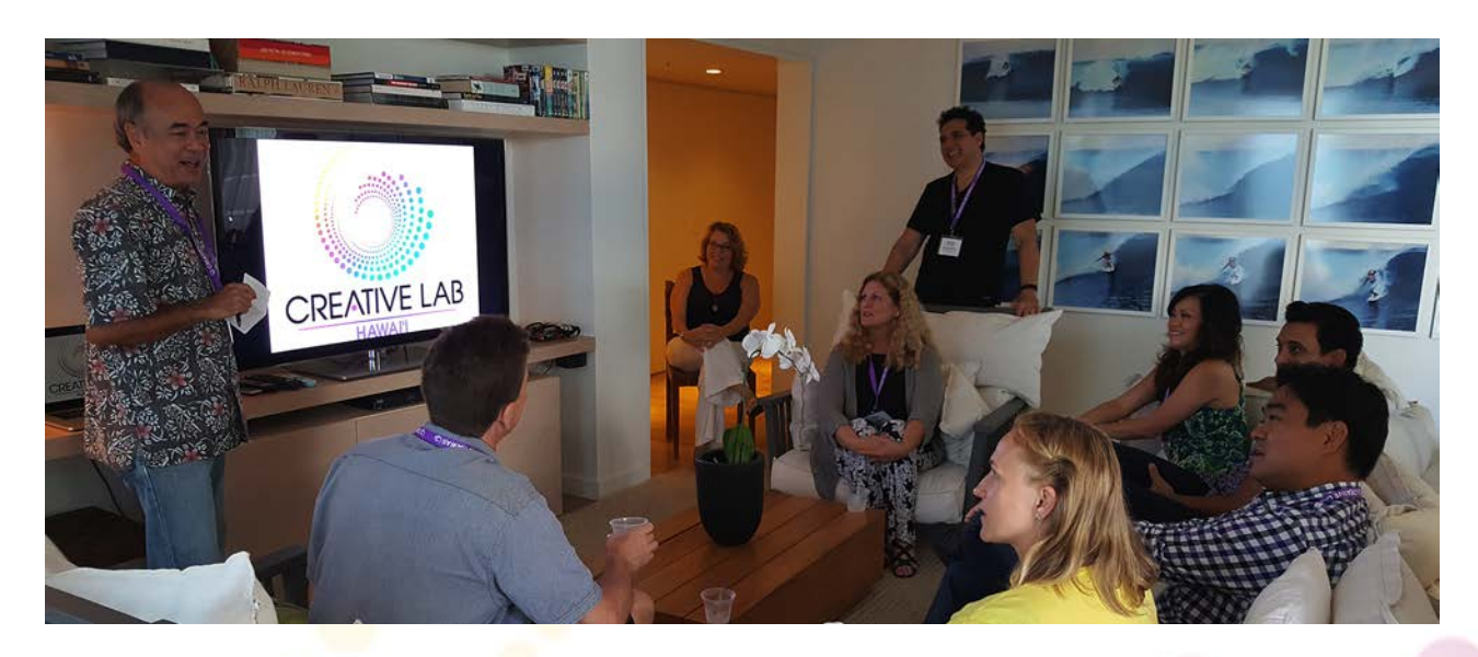
Screenwriting • Producing • Music • Web-Series • Animation • Interactive Media • Fashion/Design

Creative Lab Hawaii empowers Hawaii's creative talent to take their craft and connections to the next level—offering unparalleled access to A-list mentors and insider insights into the business behind the entertainment business.