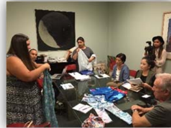
CLH Fashion Immersive Finalists kick off L.A. for business meetings