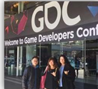
CLH Mobile Games App Immersive Fellows at the Game Developers Conference