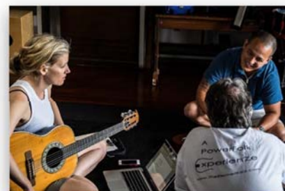
CLH Music Immersive Fellows co-writing songs for film/TV with mentors