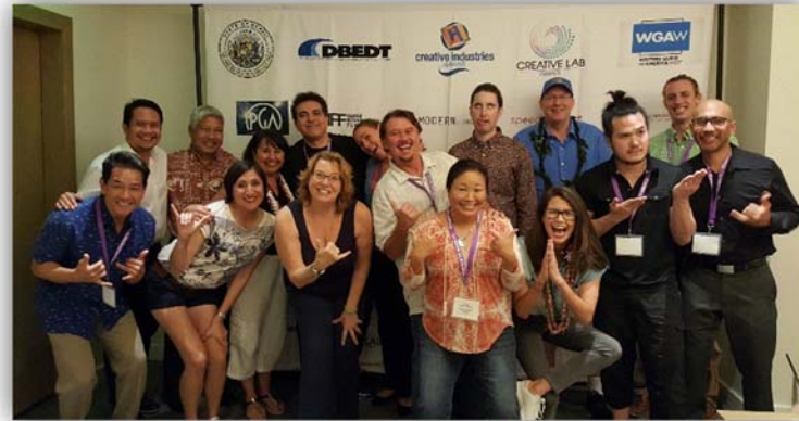
CLH 2017 Writers Immersive Fellows and Mentors