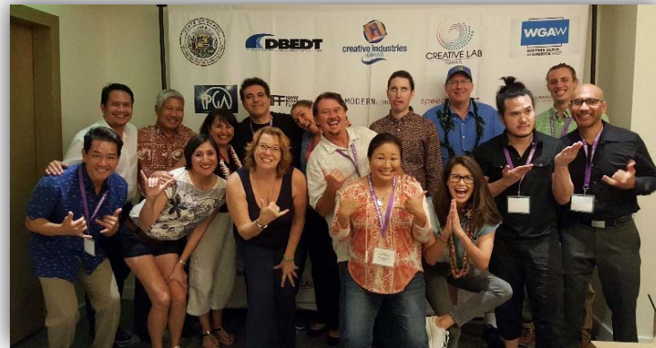
CLH 2017 Writers Immersive Fellows and Mentors