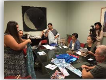
CLH Fashion Immersive Finalists kick off L.A. for business meetings