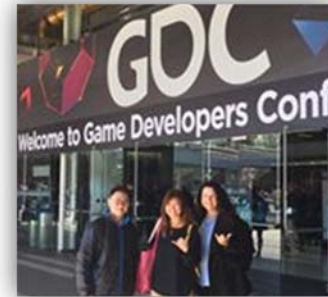
CLH Mobile Games App Immersive Fellows at the Game Developers Conference