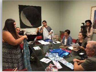
CLH Fashion Immersive Finalists kick off L.A. for business meetings