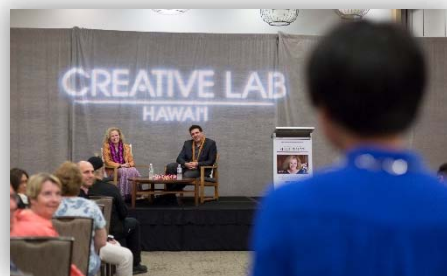
Conversation with Meg LeFauve, Academy Award winning screenwriter